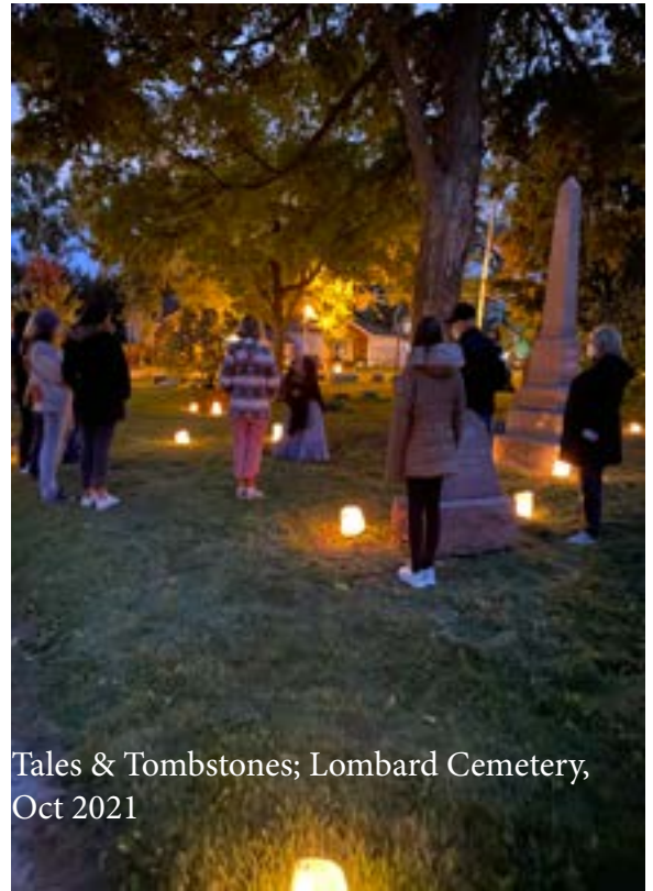
Tales & Tombstones; Lombard Cemetery, Oct 2021

For the most updated information, visit LombardHistory.org