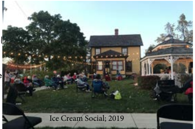
Ice Cream Social; 2019